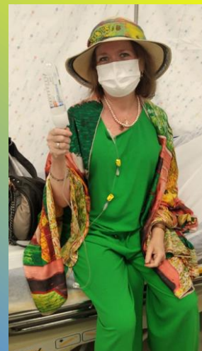
last chemo day mom is in coma