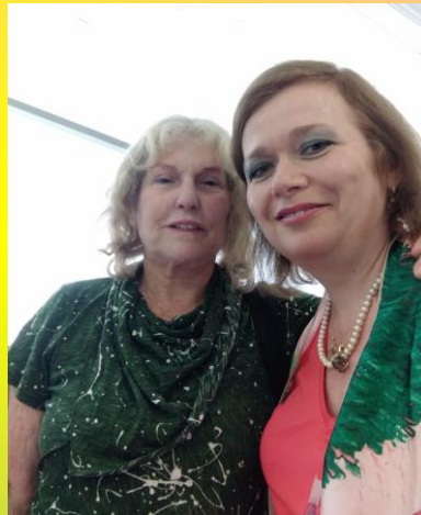
9 th chemo