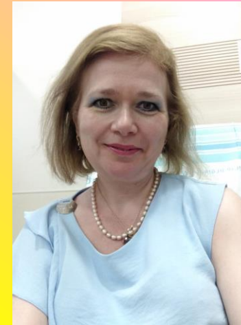
10 th chemo