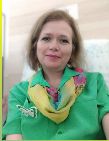
8 th chemo