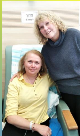
7 th chemo