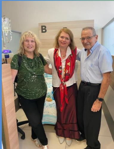
11 th chemo